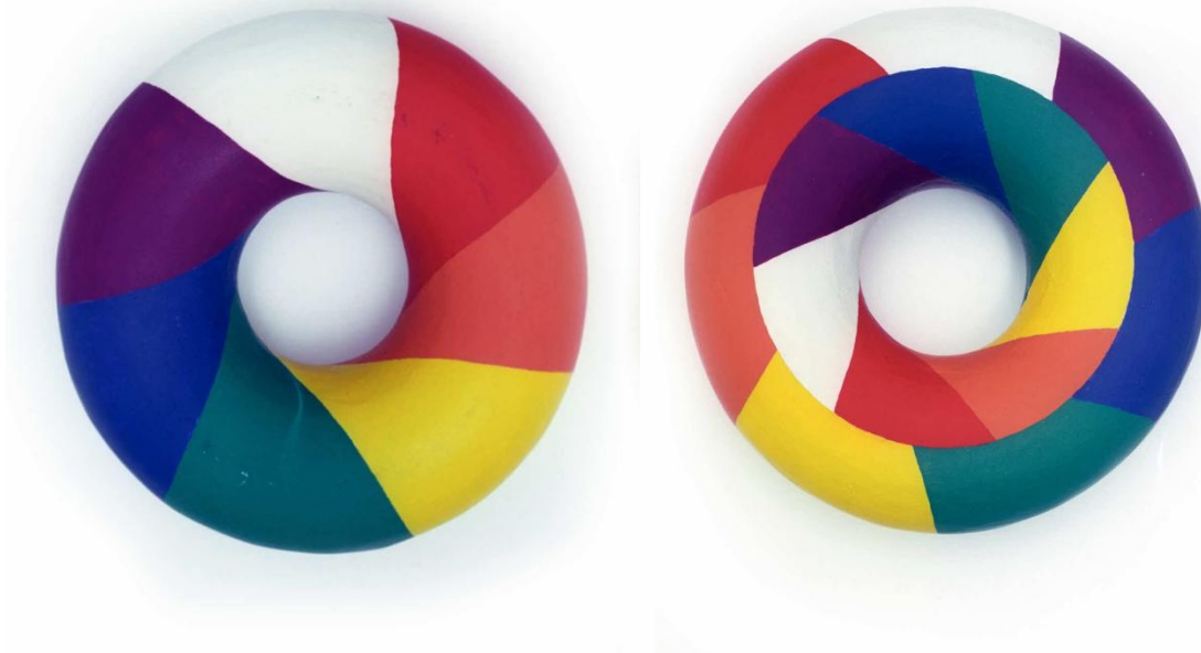
Figure 2 – Seven-Color Toroidal Mapping [32] – Top and Bottom Views – Note that each color shares a boundary with the other six colors. Such a mapping implies a minimum of a rank-7 representation.

The 15-plet becomes a “donut hole” with rank-3 SO(3,3) \sim SU(3,1) \sim 12+3 symmetries (a morphed Twistor Algebra like Example 4) shaped like an icosahedron within a minimum 3-D representation. Coincidentally, the original toroidal lattice of order 120 has the identical order as the Icosahedral Point group, I_h [31] : two singlets: I and i ; four 12-plets: C_5, C_5^2, S_{10} and S_{10}^3 ; two 15-plets: C_2 and \sigma ; and two 20-plets: C_3 and S_6 . This donut hole may represent the 15 degrees-of-freedom of the C_2 = C_4^2 icosahedral symmetries, and the WIMP-Gravitons from the previous example.