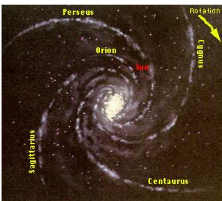
Fig. 3. The main arms of our Milky Way galaxy and our Sun and solar system on the Orion arm.